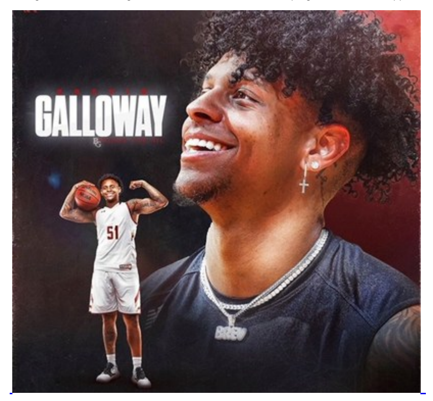
Image and Likeness). Dreamfield's proprietary technology-centered, two-way communication platform enables commercial brands to hire athletes through smart contracting for live events, social media campaigns, commercial opportunities - and/or a combination of marketing opportunities.